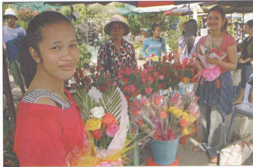
A busy Valentine's Day for this florist

He pointed out that recent years, many Cambodians saw the festival as an excuse to lose their virginity. He added that this attitude was very risky