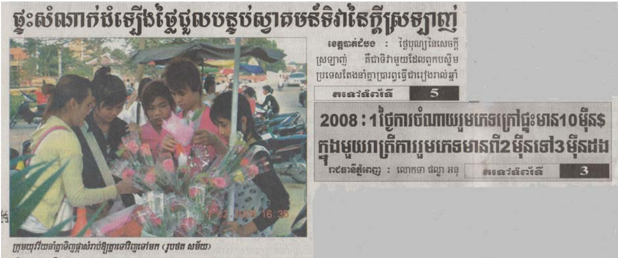
Figure 4a: Guest-house room prices were raised to welcome the Valentine’s Day in 2009, Battambang province. 66

that Nary left Liny and Kuolen for have sex by putting sexual arousal and sleeping substances inside coconut water and gave it to Liny to drink; meanwhile, Liny suffered from having sex by Kulen... Kulen got in an road accident after leaving that place. Liny got sick in a hospital and when she came back home, her parents were dead and all the things of her heritage were stolen by her relatives with fraud documentation. Liny got nothing, she became a karaoke girl, drug addicted and finally she got infected by HIV/AIDS.” 65