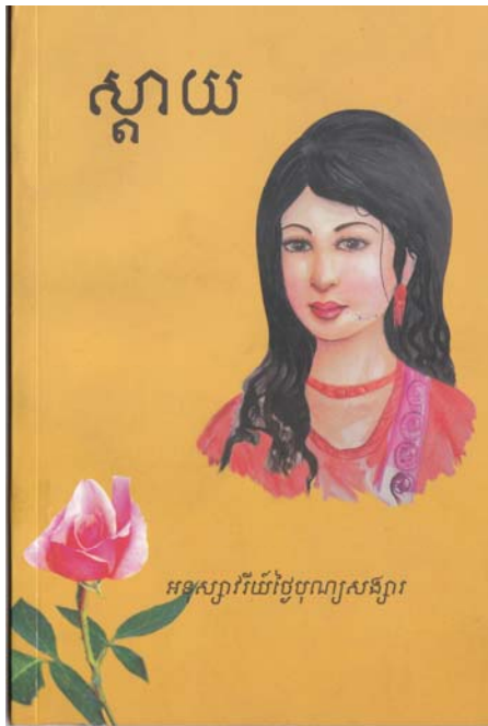
Figure 3: The novel on “Regret” Souvenir on St. Valentine’s Day in 2009 64

In 2009, there were a few publications related to the Valentine’s Day event which described the activities of middle class young people in Cambodia related to such as a novel and media intervention to confirm this finding: